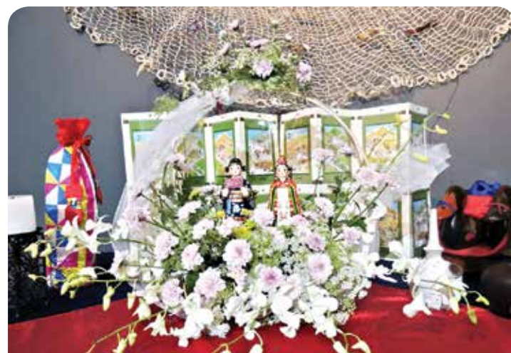
In the scorching summer, Delhiites witnessed a refreshing week when fragrant flowers were brought from Korea and was displayed by 15 Korean artists in an exhibition named, 'Floral Art & Lifestyle-II' organized by Korean Cultural Centre India which talked about 'Wedding' - the second chapter of Life.