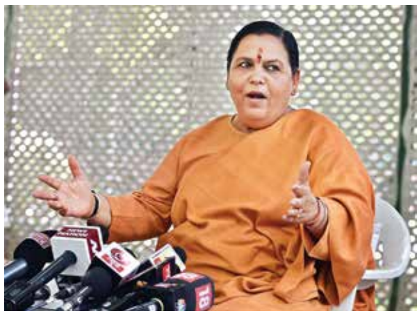
Union Minister for Water Resources and Ganga Rejuvenation Uma Bharti addressing a Press conference in New Delhi on Wednesday

"There was no conspiracy. Everything was in the open. I took part in Ram temple campaign with pride and confi-