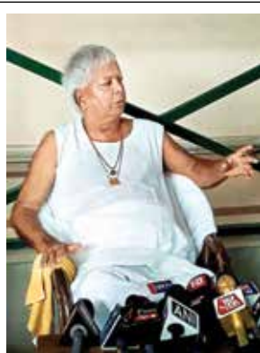
RJD Chief Lalu Prasad at a Press conference in Patna

"It is well known that the CBI does what the government desires," the RJD chief claimed.