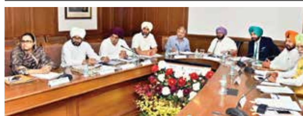
Punjab Chief Minister Amarinder Singh presides over a cabinet meeting