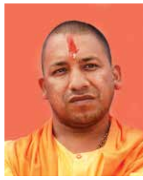
opening new accounts.

Rooting for extending banking services to maximum number of people, he said a drive should be launched for