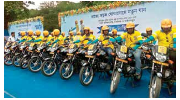
Minister Suwendu Adhikari flagged off the bike taxis on Wednesday