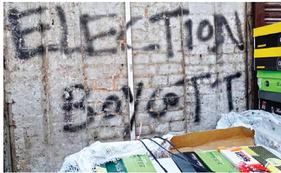
An expression of protest sprayed on a wall in old city Srinagar

On April 16, a video clip was uploaded on social media of a trader of Pulwama town denouncing India and begging for his life with guns pointed at him. In another video from the same district, a civilian was seen