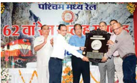
West Central Railway's Jabalpur division secures Rajbhusha proficiency shield during its 62nd Railway Week celebration event on Tuesday