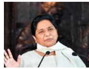
Party supremo Mayawati

not as strong in urban areas (as in rural areas), the decision has been taken in view of the growth in people's support in urban areas as well, the release said.