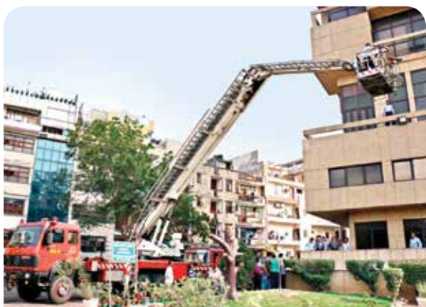
IndianOil's Northern Region kicked off Safety week celebrations by observing National Fire Service Day to create awareness on fire prevention, fire protection and renew employees' commitment towards safety. All employees of IndianOil Northern Regional Office took the safety pledge with determination to follow safety norms and keep "safety" at top